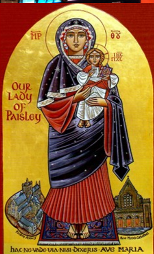
Our Lady of Paisley; pray for us